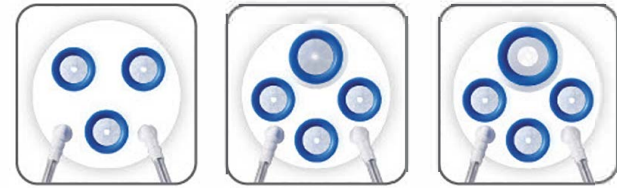
LS-51-1313 LS-51-1316 LS-51-1318