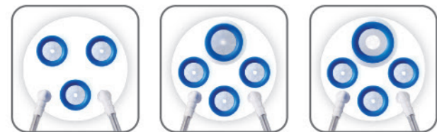
Lapsingle-41-1313 Lapsingle-41-1316 Lapsingle-41-1318